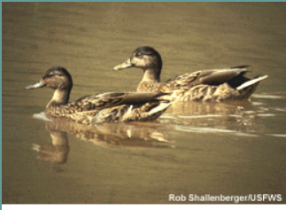
Duck (koloa maoli)