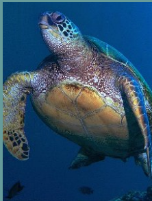
Green sea turtle (honu)