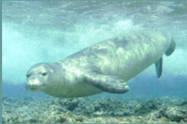
Hawaiian monk seal (ilio-holo-i-ka-uaua)