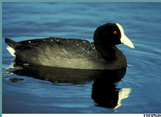
Coot (ʻālae keʻokeʻo)