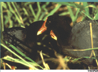
Moorhen (ʻālae ʻula)