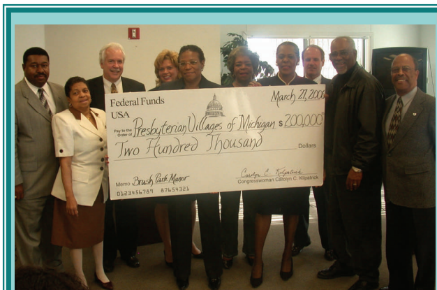
Congresswoman Kilpatrick presents staff, board members, and residents of Presbyterian Villages of Michigan with a check representing federal funds appropriated for The Village of Brush Park Manor Paradise Valley.

Wyandotte 3005 Biddle St., Suite A Wyandotte, MI 48192 Phone: 734.246.0780 Fax: 734.246.1148