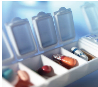
The deadline to enroll in the Medicare Rx Plan is May 15.

The new Medicare Prescription Drug Program is confusing and difficult to navigate. I believe seniors should have more time to enroll; therefore, I am supporting the Medicare Informed Choice Act. This legislation extends the deadline to December 31 and delays any late enrollment penalties until 2007. This bill also allows beneficiaries the option of changing plans once in 2006.