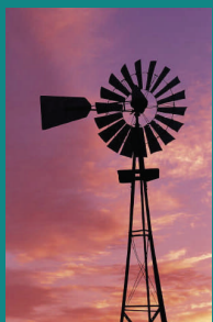
The City of Wyandotte’s wind energy project will be the first application of renewable energy wind turbines in an urban brownfield setting.

“Home energy costs and gas prices are out of control. We must make energy more efficient and affordable for America’s families.”