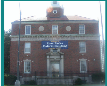
Congresswoman Kilpatrick introduced H.R. 2967, legislation to name the building that currently houses the Federal Homeland Security Office the "Rosa Parks Federal Building." Below, she participates in the ribbon-cutting during the dedication.