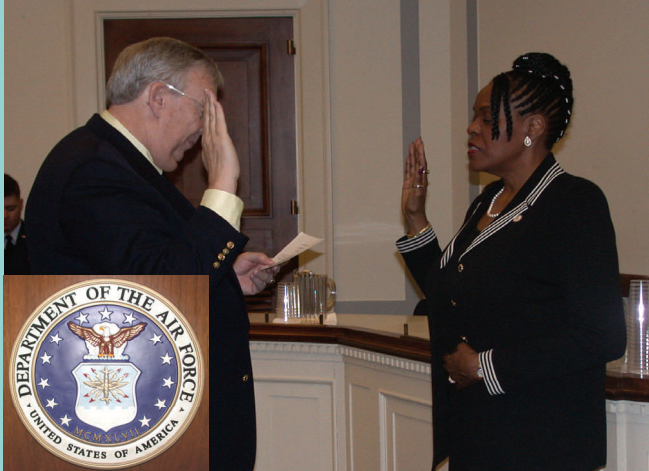
Congresswoman Kilpatrick is the first African American woman to serve on the Air Force Academy Board of Directors.

The first responsibility of our government is the security of every American. Our country is best protected and freedom best advanced when national security policies—including homeland, energy, and diplomatic strategies—are tough and smart. I support the Democrats' Plan for Real Security . We must protect Americans and restore our country's position of leadership in the world.