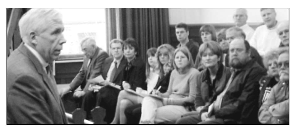
Town Meetings give me the opportunity for a "Listening Tour" of the 10th District, hearing concerns and answering questions from constituents on matters ranging from international affairs to transportation issues. The schedule for upcoming Town Meetings is below.