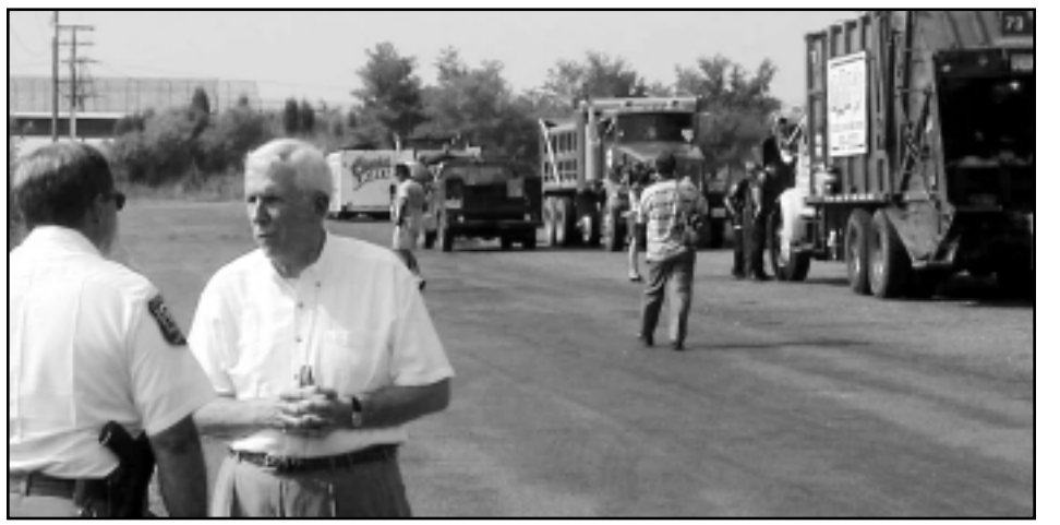
Working to keep unsafe trucks off local highways and out of neighborhoods is a top priority. Nine of the 14 trucks inspected at this safety inspection checkpoint on Route 28 last August failed and were immediately taken out of service. Some had bad brakes; others had bald or flat tires. One had faulty steering.

We look forward to serving you on armed services, veterans, business, federal contracts, consumer, federal employee and retirement, immigration, Medicare, Medicaid, Social Security, or passport issues or any other matter for which you need assistance from the federal government.