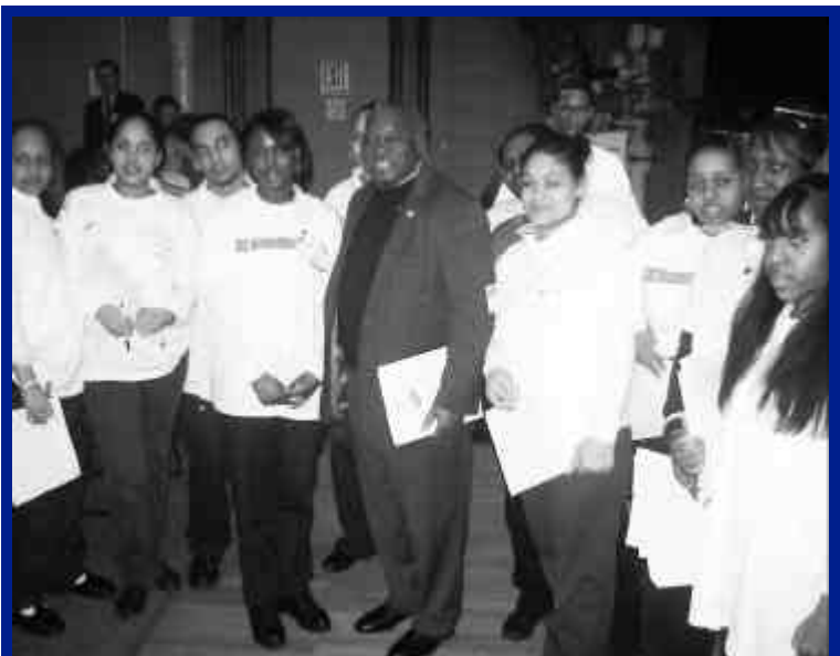
Congressman Owens at a meeting with students of the 11th Congressional District discussing important issues that face our children in terms of the state of education in Brooklyn.

All interested high school artists in the 11th Congressional District may participate in "An Artistic Discovery", the Annual High School Congressional Art Contest by submitting their entries by 5:00 PM on Monday, May 16 to my office at 289 Utica Avenue (between Union and Eastern Parkway). The winner will be announced no later than May 20. This is a great opportunity to present talented young artists in the district. The winning art piece will be displayed in the Capitol Building in Washington D.C. for a year and the runner-up will be displayed in my office in Washington, D.C. for a year. All artwork must be original, appropriate to hang in our nation's Capitol, two-dimensional, no larger than 32 x 32 inches. For information and a complete set of guidelines contact my office at 718-773-3100.