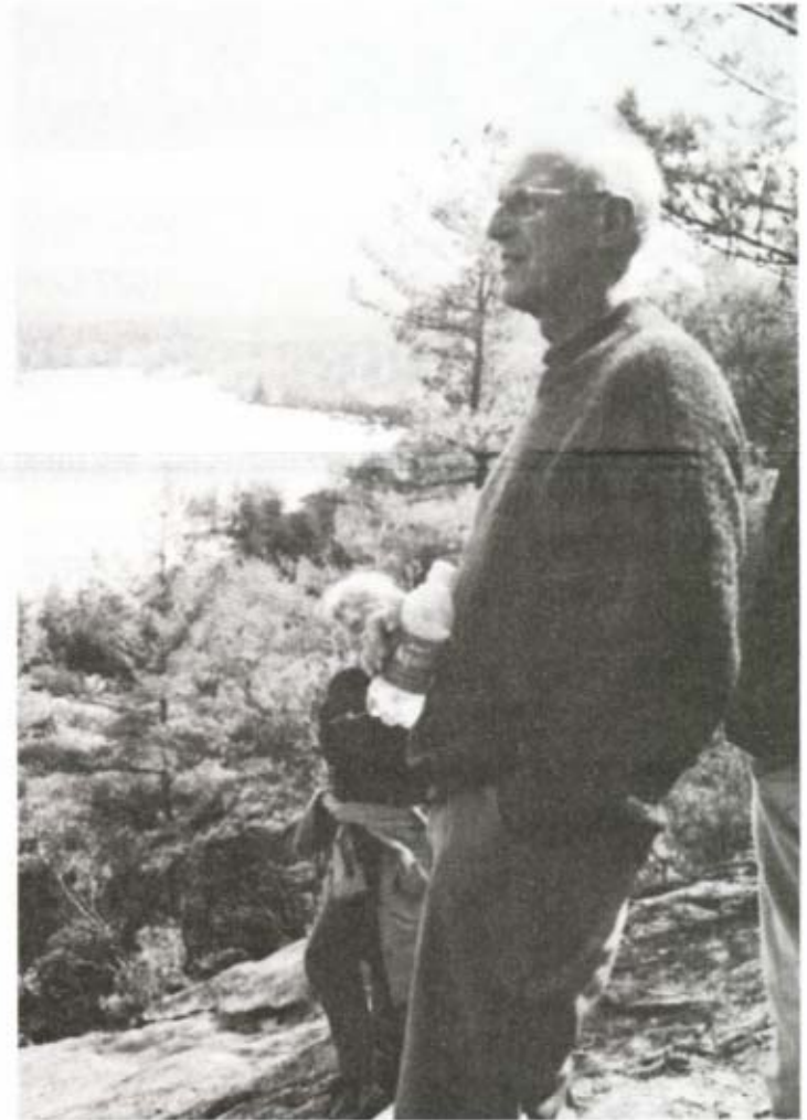
In my work on conservation issues, I recently surveyed with other visitors this striking vista near the Appalachian Trail.

I have called on the President to promote energy conservation and urge OPEC and non-OPEC oil producers to increase production of crude oil for short-term relief. I have also joined many of my colleagues in the House to request the Justice Department to investigate possible energy price fixing and give thorough anti-trust reviews to any proposals to further consolidate energy companies.