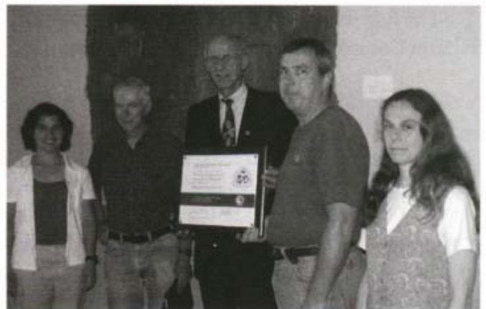
Earlier this year, I received a national award for my legislative efforts on behalf of First Congressional District hiking trails.

Massachusetts' unique landscape and wildlife must be protected from sprawl and over-development. I have sponsored a bill to authorize the National Park Service to conduct a study of the Mattabesett-Metacomet-Monadnock-Sunapee trails for possible addition to the National Scenic Trail system. This group of trails and potential links, starting at Long Island Sound and connecting with the Appalachian Trail in New Hampshire, would provide over 250 miles of continuous walking trail of scenic, historic and cultural quality.