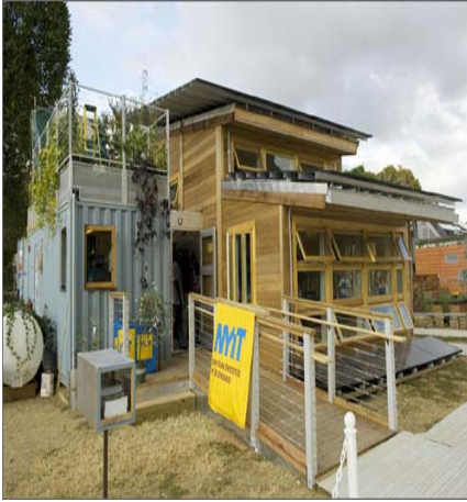
The NYIT/USMMA solar-hydrogen house at the International Solar Decathlon