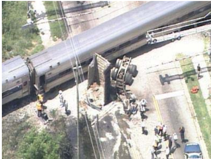
Figure 2: Amtrak Train Grade Crossing Collision August 2005

resulting collision killed the truck driver and his passenger, injured 14 Amtrak passengers, and derailed the train's locomotive and four of its seven cars.