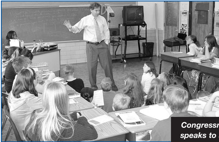
Congressman Brown speaks to students in Ohio's 13th District about his job in Congress.

For updates and information or to share your views on issues important to you, please visit www.house.gov/sherrodbrown/