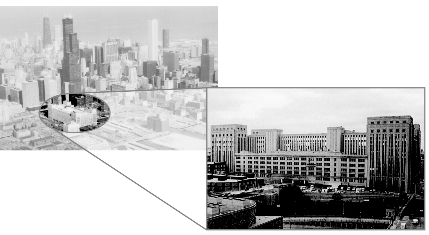
Figure 3: The Former Main Post Office in Downtown Chicago, Illinois