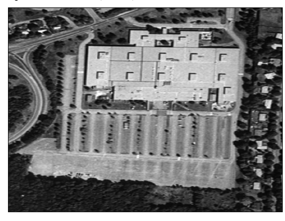
Figure 4: IRS Service Center, Andover, Massachusetts