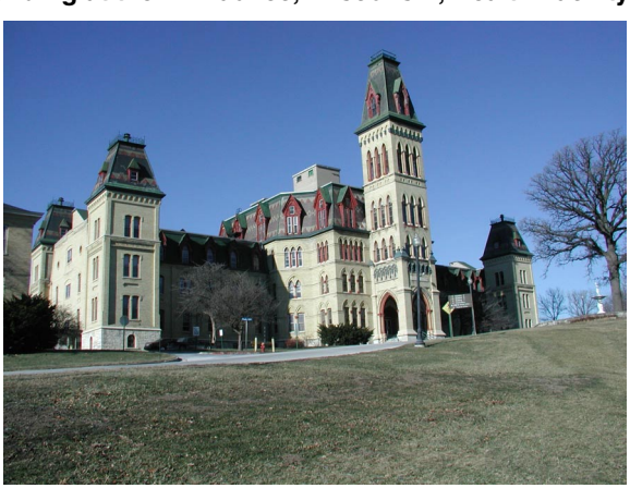
Figure 1: The Former Main VA Hospital Building at the Milwaukee, Wisconsin, Health Facility Campus