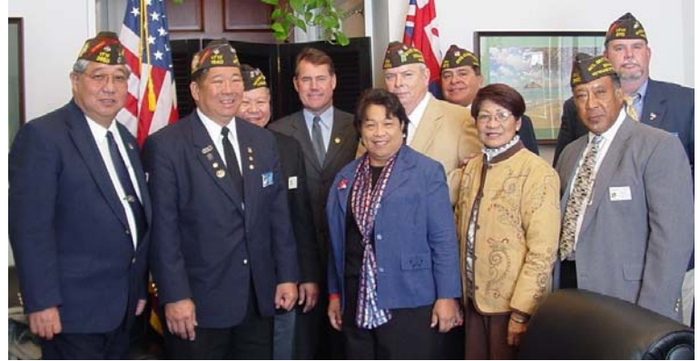
Hawai'i is home to almost 120,000 veterans; here Congressman Case addresses concerns with visiting vets.