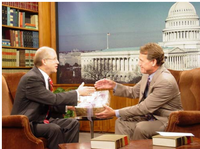
Congressman Case says mahalo to David Walker, Comptroller General of the United States and head of the Government Accountability Office, at the taping of one of his monthly public access television congressional reports, this one on our rapidly deteriorating federal budget.