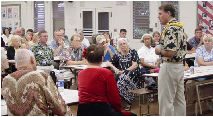
Congressman Case addresses federal concerns with constituents at one of his 129 Talk Story districtwide community meetings to date.