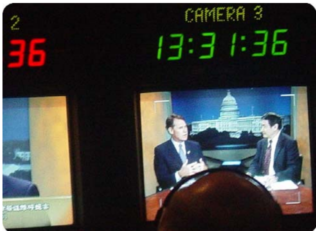
Congressman Case discusses U.S.-China relations on one of his two Voice of America call-in shows broadcast live to an estimated ten million-plus audience in the People's Republic of China.