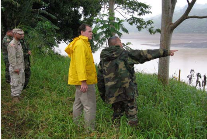
Congressman Case inspects Ka Loko Dam disaster site on Kauai.

It's impossible to list all of my 109th Congress efforts, but here are a few highlights. Please contact me for more information, or visit my website at www.house.gov/case .