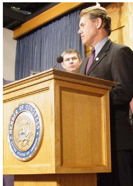
Congressman Case (with colleague Mike Ross of Arkansas) responds to questions at a national press conference in the Capitol highlighting our federal budget crisis.