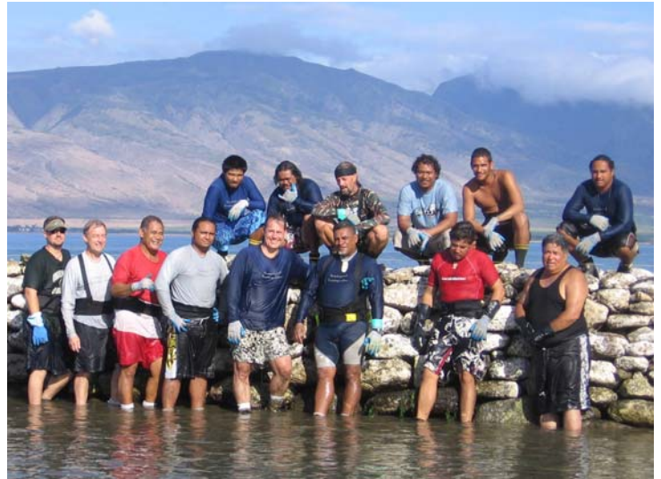
Congressman Case discusses cultural preservation with 'Ao'ao O Na Loko l'a O Maui in reconstruction of Maui's Ko'ie'ie fishpond.