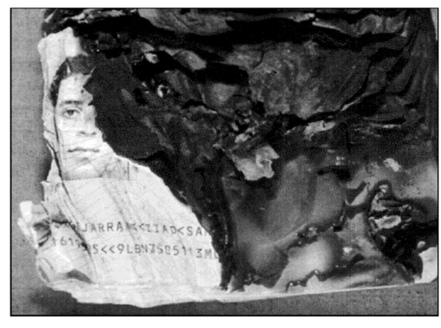
A partly-burned copy of Ziad Jarrah's U.S. visa recovered from the Flight 93 crash site in

In other words, the 9/11 hijackers had been taught what to do to attain successful entry into the United States. The frustrating irony is that at least some of the hijackers could have been denied admission into the United States if critical information had been provided to border officers via lookouts or regarding the passports themselves. Today, we have the ability to provide that information to our border security personnel as long as a passport or verifiable biometric equivalent is required for admission. However, where there is no passport or equivalent biometric travel document required for admission, as is currently the de facto case in the Western Hemisphere, our border personnel have little to no baseline upon which to make an initial judgment about whether a particular individual may pose a terrorist or public safety threat to the United States.