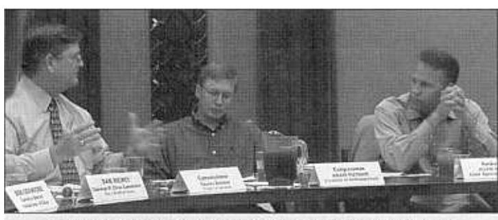
U.S. Trade Representative for Agriculture Allen Johnson meets with Rep. Putnam and Florida Commissioner of Agriculture Charles Bronson to discuss Florida agricultural trade issues at Florida Citrus Mutual.

meet all of the objectives of Florida agricultural producers. However, language was included in the bill to require consultative procedures before Congress