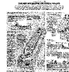
How overseas ships bring welcome visitors from Asia