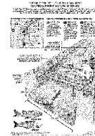
Keeping Asian carp out of the Great Lakes