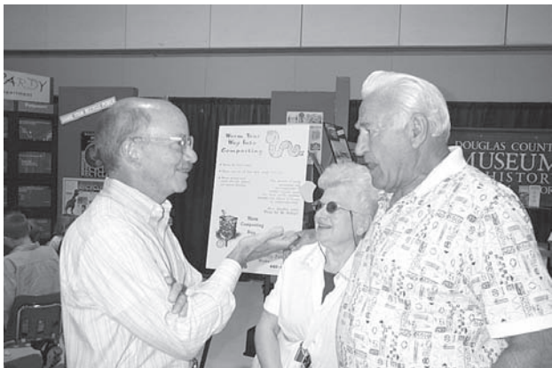
Rep. DeFazio talks with seniors about Social Security and other important issues during a recent visit to Douglas County.

The privatization commission alleges that Social Security will go bankrupt in 2016. They assume that the federal government will not, as required by law, put its full faith and credit behind the Trust Fund, or continue to pay interest on those funds. That's simply not true. The commission makes these false claims in order to generate support for their own privatization proposals, despite their shortcomings (see p. 3).