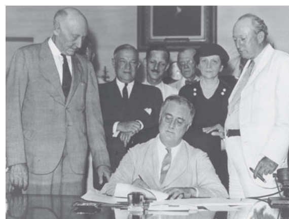
In 1935, President Franklin Roosevelt signed Social Security into law. Today, the program is facing financial challenges.

Retired workers and their families rely on Social Security for most of their income. Average middle-income older Americans receive 66 percent of their retirement income from Social Security, only 15 percent from private pensions, and just 10 percent from savings.