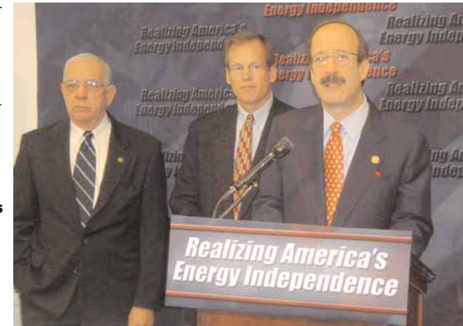
Congressman Engel speaking at the press conference on the introduction of "Fuel Choices for American Security Act." Also pictured are the Act's co-authors Congressman Jim Saxton and Jack Kingston.

Engel's legislation would end this inequity and provide incentives for workers to use public transit instead of driving to work.