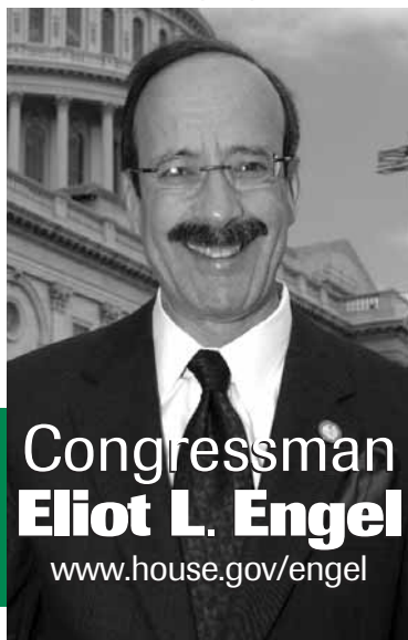
Congressman Eliot L. Engel www.house.gov/engel

He is working with other Members of Congress to have the Environmental Protection Agency (EPA) accurately report to the American people how much pollution is being eliminated and how it enforces our environmental laws. The health of our natural resources depends upon the EPA's willingness to tell the truth to the American people.