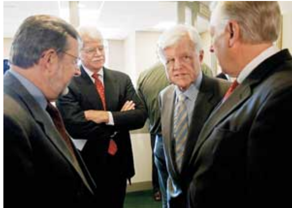
WAGE WAR: Obey, Rep. George Miller, D-Calif., Kennedy and Minority Whip Steny H. Hoyer, D-Md., plot bicameral strategy to win an increase.

Other members who asked Boehner to reconsider were Republican Reps. David L. Hobson of Ohio and Mike Simpson of Idaho, both longtime allies of the majority leader.