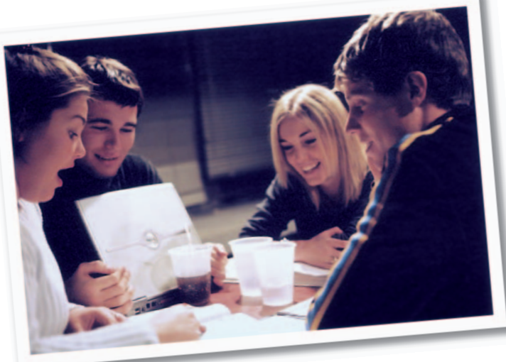
Creativity and enthusiasm are often the sparks that ignite a successful business.

Young people under the age of 20 started each one of these businesses. All it takes to get started is just one great idea!