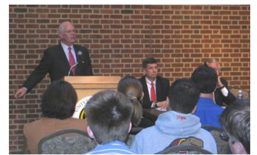
Benjamin L. Cardin Member of Congress

Yes, please send me these informational E-News Updates in the future.*