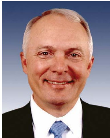
Congressman John Kline