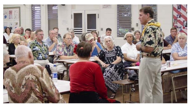
Congressman Case addresses federal concerns with constituents at one of his 129 Talk Story districtwide community meetings to date.