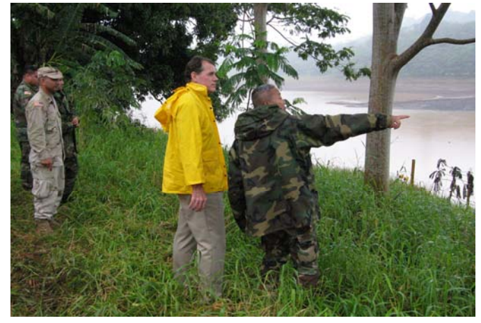
Congressman Case inspects Ka Loko Dam disaster site on Kaua'i.

information, or visit my website at www.house.gov/case.