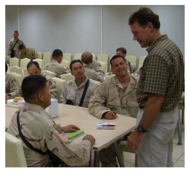
Congressman Case discusses equipment and morale with Hawai'i troops of the 29th Brigade Combat Team at LSA Anaconda. Balad. Iraq.