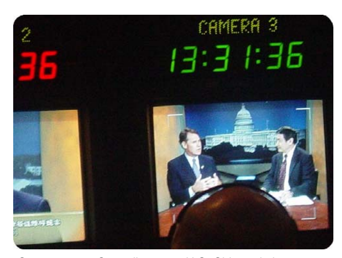
Congressman Case discusses U.S.-China relations on one of his two Voice of America call-in shows broadcast live to an estimated ten million-plus audience in the People's Republic of China.