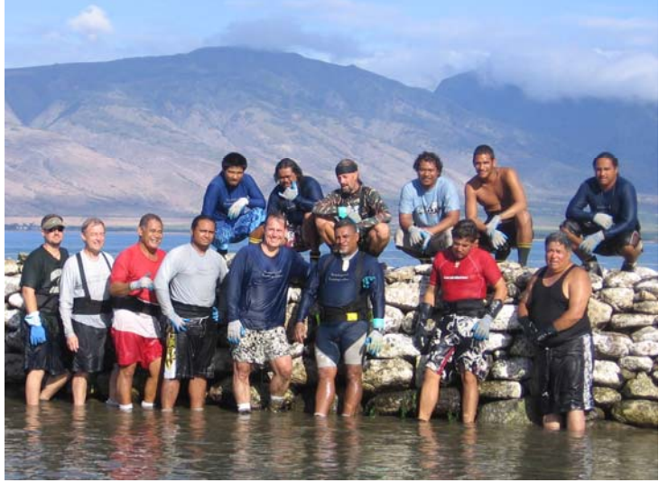
Congressman Case discusses cultural preservation with 'Ao'ao O Na Loko I'a O Maui in reconstruction of Maui's Ko'ie'ie fishpond.