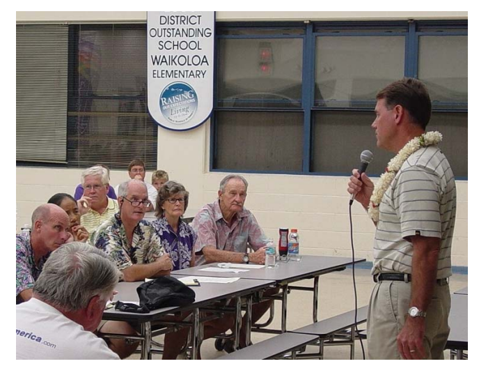
Congressman Case at one of over 40 Talk Story town meetings districtwide, this at Waikoloa discussing education and other issues