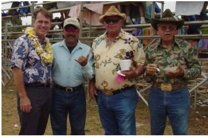
Congressman Case talking agriculture with Makawao constituents