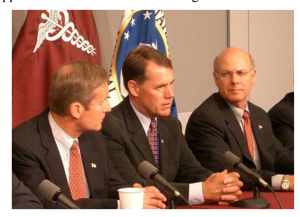
Congressman Case briefs the media about Iraq with colleagues at Landstuhl Army Regional Medical Center, Germany