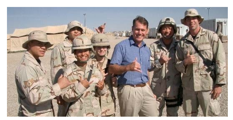
Congressman Ed Case discusses troop morale while visiting the Hawai'i troops serving in Kirkuk, Iraq