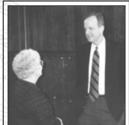
Congressman Moran talks with a Lyons resident at a town meeting.