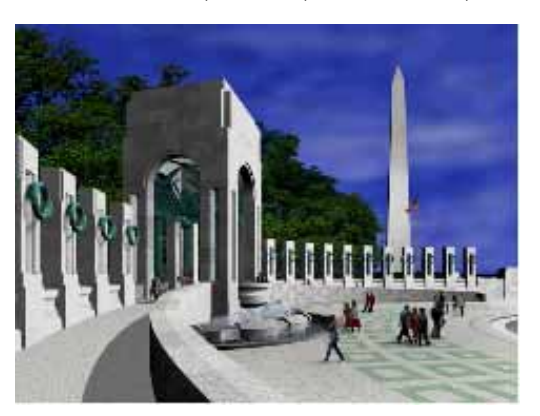
The National World War II Memorial will be dedicated Saturday, May 29, 2004 in Washington, DC.

The National World War II Memorial is the first national memorial dedicated to all who served during World War II. The memorial, established by the American Battle Monuments Commission and situated prominently on the National Mall, will honor all 116 million who served in the U.S. armed forces, the 400,000 who died, and the millions who supported the war effort from home.