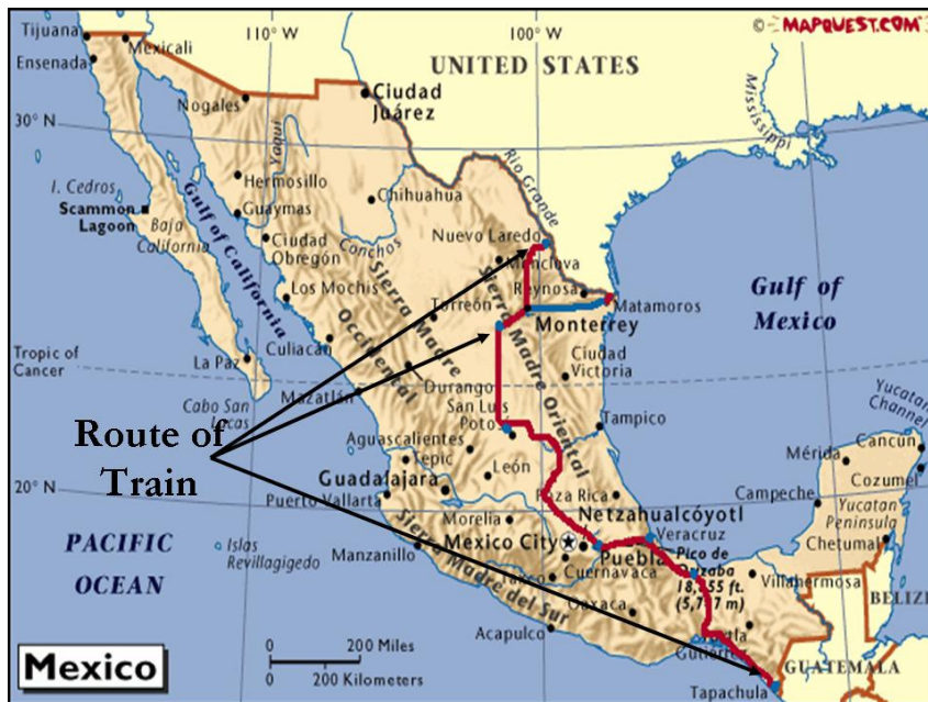
Train routes from Central America and Mexico with U.S. Destinations

The El Paso-Juarez corridor in west Texas also serves as the gateway for drugs destined to major metropolitan areas in the United States. Mexican drug cartels transport significant quantities of marijuana and cocaine through the El Paso Port of Entry using major east/west and north/south interstate highways. These highways provide the Mexican cartels with transportation routes for drug distribution throughout the United States. Drug cartels also obtain warehouses in El Paso for stash locations and recruit