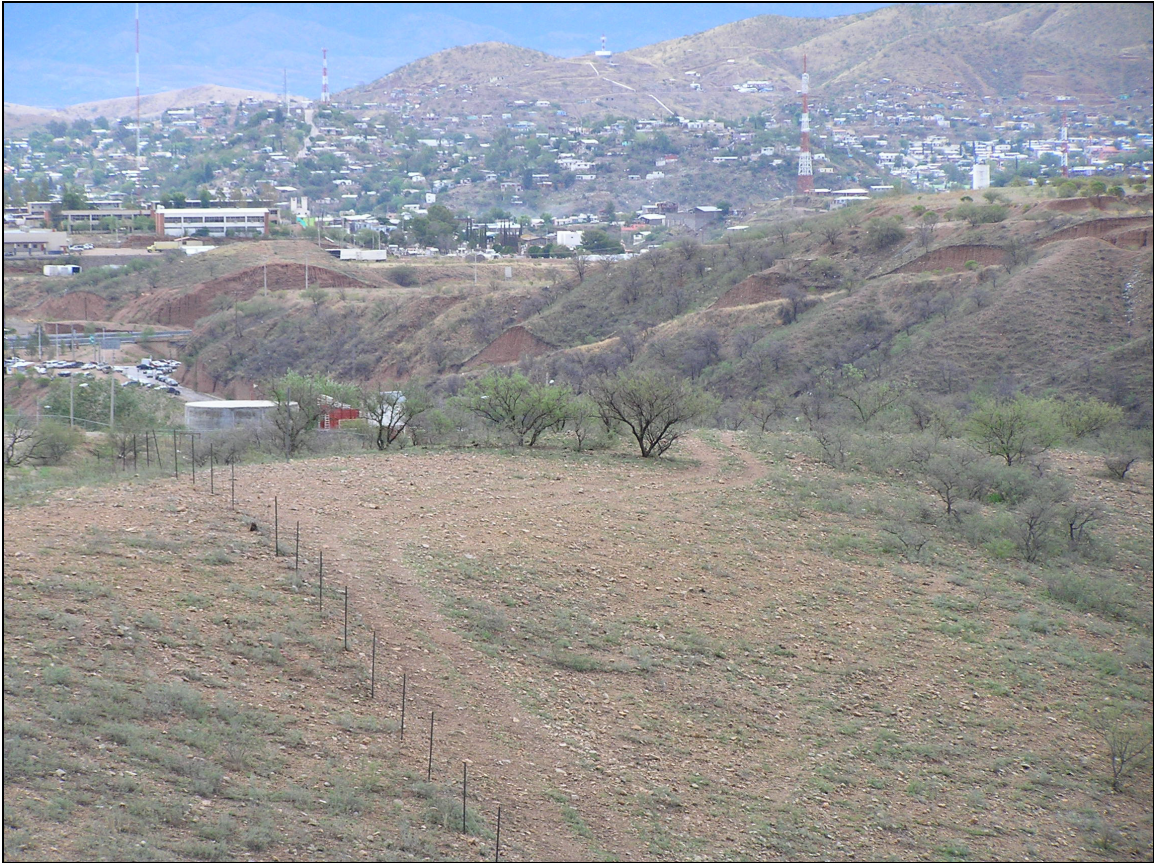
U.S.-Mexico border in Arizona

In addition to Federal agents, State and local law enforcement also patrol the border areas. In remote areas along the border, many sheriffs' departments are called upon to address border-related criminal matters and serve as a backstop to CBP operations. In many cases, these local law enforcement agencies do not have the resources necessary to patrol the thousands of square miles of border territory under their respective jurisdiction, leaving the security of the border vulnerable.