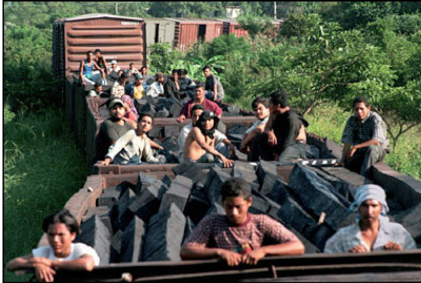
Trains from Central America and Mexico en route to the U.S. border