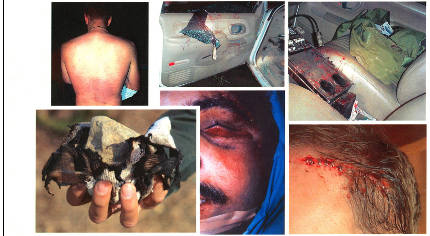
Injuries suffered by Border Patrol agents from rocks thrown