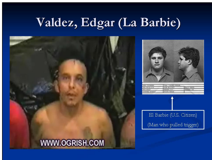
“La Barbie,” head of the Sinaloa enforcers alleged to have killed members of Zetas

camera captor. Law enforcement authorities have never found the body of the murdered Zeta, nor the other three men, dead or alive. 25