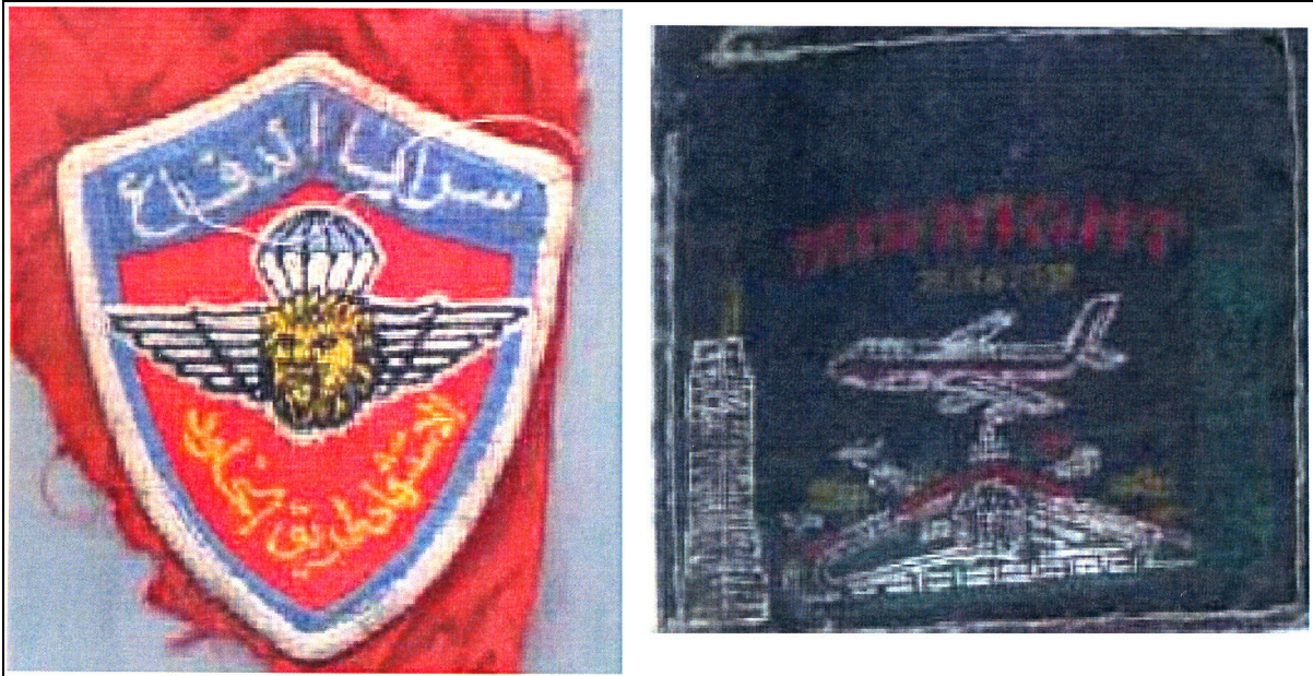
Military patches found along the Texas border.