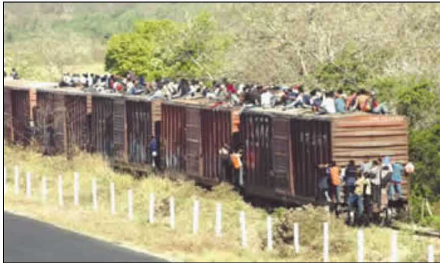
Trains from Central America and Mexico en route to the U.S. border

The South Texas region covers approximately 625 miles of border territory – a total area of 20,963 square miles and borders three separate Mexican States. Inside the territory are 11 Ports of Entry that include 15 international bridges. Directly across the cities of Brownsville, McAllen, and Laredo are major Mexican cities, each with a population between 600,000 and 800,000.