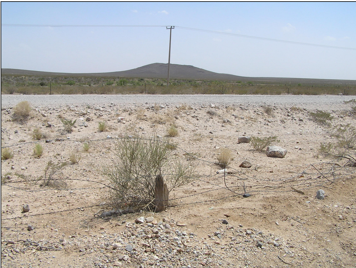
U.S.-Mexico border in New Mexico

The United States border with Mexico extends nearly 2,000 miles along the southern borders of California, Arizona, New Mexico and Texas. In most areas, the border is located in remote and sparsely populated areas of vast desert and rugged mountain terrain.