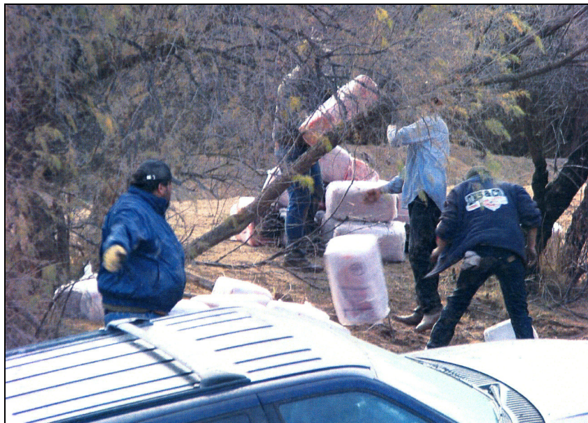
Cartel members unloading drugs after failed attempt at U.S. entry during alleged military incursion January 23, 2006

On January 25, 2006, the Ambassador sent a Diplomatic Note to the Mexican Government regarding the January 23, 2006 border incursion in Hudspeth County, Texas. Ambassador Garza requested the Mexican government fully investigate the January 23 incident in which individuals dressed in military uniforms, carrying military-style weapons, and using military vehicles intervened to prevent a drug shipment from being intercepted by U.S. law enforcement operating in the United States. 71