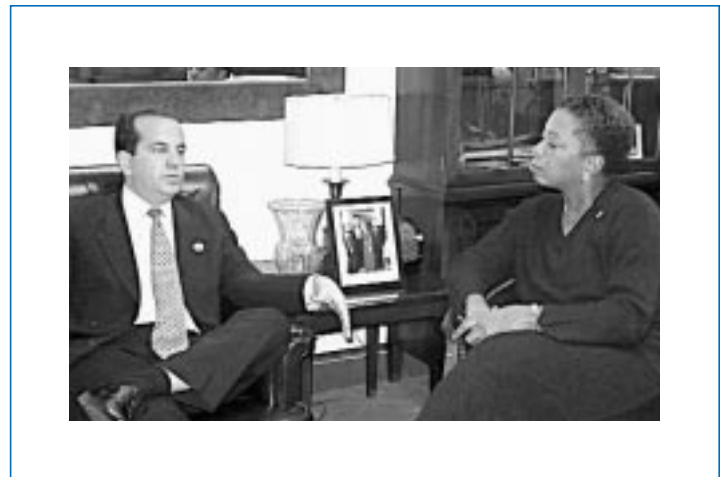
Delegate to Congress Donna Christensen meets with Puerto Rico' Resident Commissioner Anibal Acevedo-Villa, on developing the best strategy for insuring that the Virgin Islands will be successful in maintaining the same level of rum tax rebate, and ultimately lifting the cap entirely.

As I begin my third term, a new administration, power sharing in the Senate, a closer margin for the majority in the House, and the individual priorities of a new Cabinet certainly present us with new challenges. As always, we will do our very best to turn them into opportunities. This will take increased vigilance and