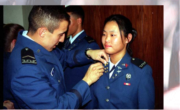
U. S. AIR FORCE ACADEMY Colorado Springs, Colorado

U. S. MILITARY ACADEMY West Point, New York