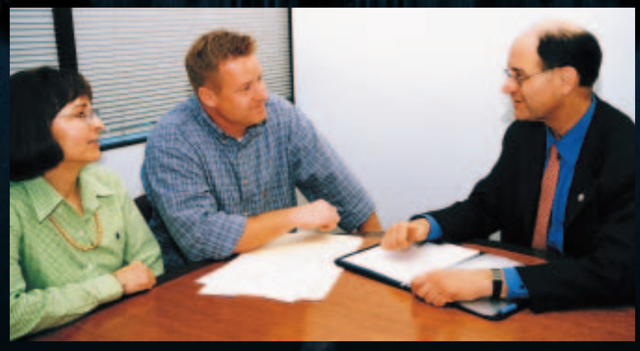
Congressman Sherman and Valley residents discuss solving problems with federal agencies.

Visit Our Web Page. Sign-up for periodic reports on what is going on in Congress. Tell us what you think—complete the Federal Issues Questionnaire.