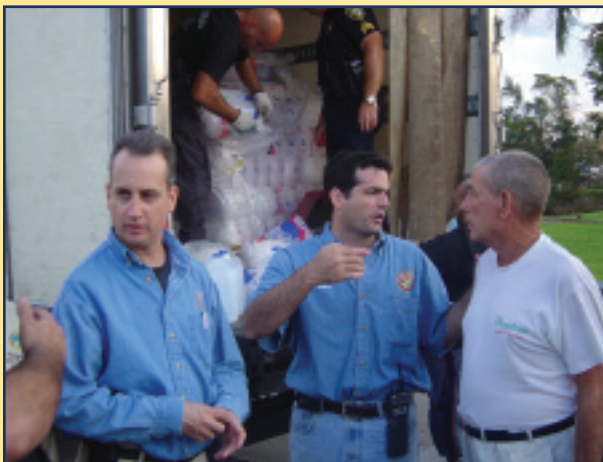
Congressman Mario Diaz-Balart assesses community needs with local leaders following Hurricane Wilma.