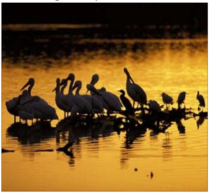
Rep. Devin Nunes supports an effort in Congress to update the Endangered Species Act. After 30 years on the books, the law has failed to achieve its goals and a new approach is needed.

The Endangered Species Act (ESA) was passed by Congress in 1973 with the intent to protect and preserve species that have been identified as threatened or endangered. Over the past 30 years, more than 1,250 domestic species have been listed for protection; however less then one percent of these species have actually been "recovered." Not only has ESA fallen well short of its goals, its misguided implementation has left many farmers, ranchers, and small businesses just as endangered. When plans for U.C. Merced, the only University of California campus in the San Joaquin Valley, were delayed because of fairy shrimp, one could clearly see that the outdated ESA had deviated from its original intent. Furthermore, when environmentalists place microscopic organisms above the needs of farmers, on whom we depend for our food,