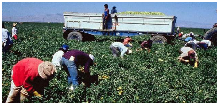
CRLA violated federal law by engaging in impact litigation related to farm workers

The Congressman immediately contacted the Office of Inspector General (OIG) and subsequently referred the source to them. The OIG immediately began an investigation that has finally