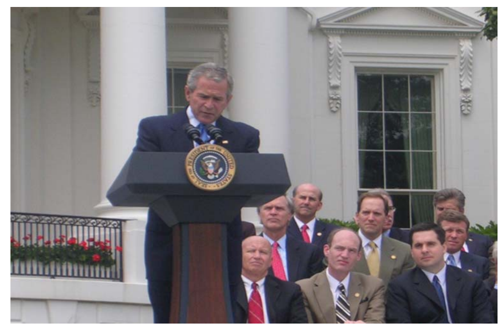
Rep. Nunes, seated next to Rep. McCotter (R-MI) on the South Lawn of the White House for the tax bill signing