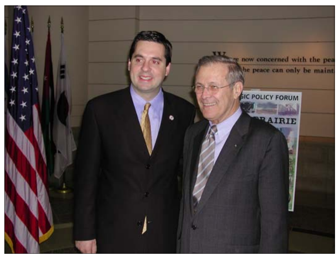
Rep. Devin Nunes poses with Defense Secretary Donald Rumsfeld following a strategic exercise Feb. 11 aimed at preparing for a bio-terrorist attack against agriculture.

Bio-terrorism against agriculture involves the deliberate introduction of a disease agent, either among livestock or in the food chain for purposes of undermining stability in the economy or generating fear.