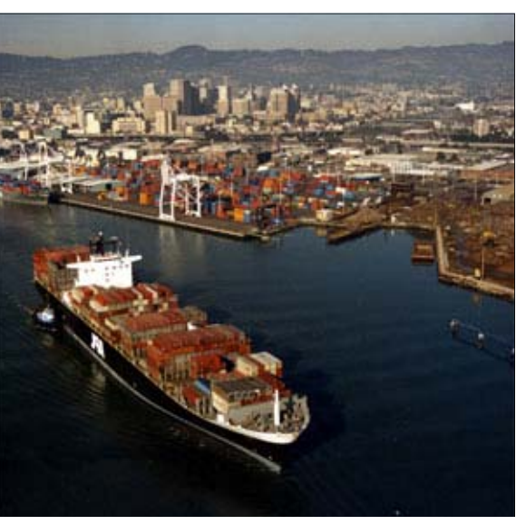
Port of Oakland

He urged the President to consider ways to ensure that the agreements do not adversely impact these small businesses and that the trade initiatives should allow exemptions from tariff reductions for industries like the canned fruit sector, which have highly importsensitive tariffs.