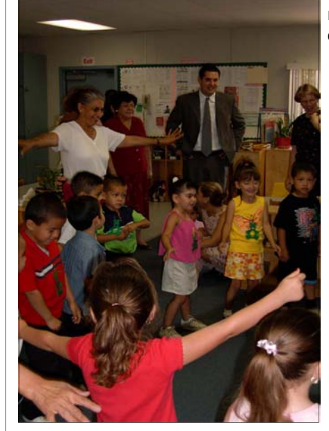
Rep. Nunes visits students at a Head Start center in Porterville.