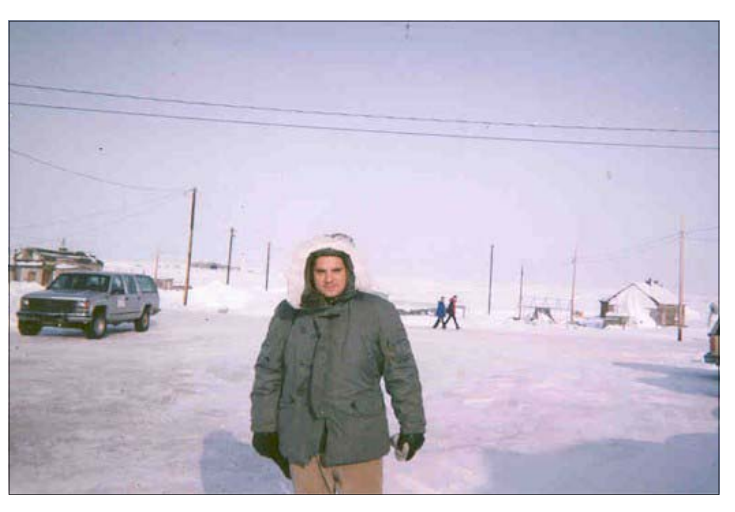
Rep. Devin Nunes traveled with other Congressmen to Alaska on a fact finding mission regarding domestic oil supplies.

Consequently, Congress put together a comprehen-