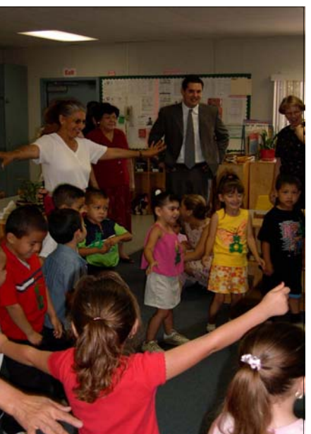
Rep. Nunes visits students at a Head Start center in Porterville.