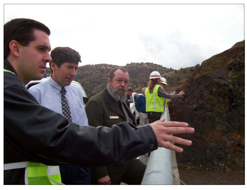
Above-Rep. Nunes discusses the completion of a new spillway at Terminus Dam with Army Corps of Engineer officials Norbert Suter and Phil Deffenbaugh. Below- Workers finish the spillway to provide Tulare County communities with better flood protection.

While the unique spillway increases lake capacity, Army Corps of Engineer officials are also busy improving recreational facilities around the perimeter of the lake.