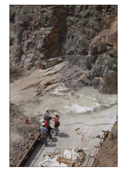
Workers continue Terminus Dam spillway project.

$1 million for the Regional Drainage Plan for lands in and around the San Luis Unit of the Central Valley Project