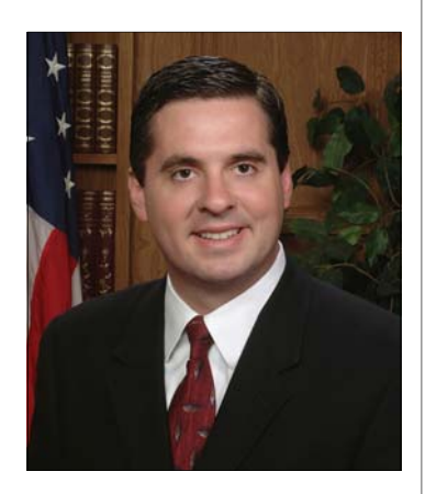
Rep. Devin Nunes is Vice Chairman of the newly formed Congressional Hispanic Conference.

In the case of judicial nominees, the Hispanic Conference is committed to ensuring that only the best qualified nominees are ap-