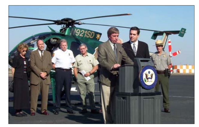
Reps. Doug Ose (center) and Devin Nunes (right) address the media during a press conference after a Congressional hearing on drug production on public lands.