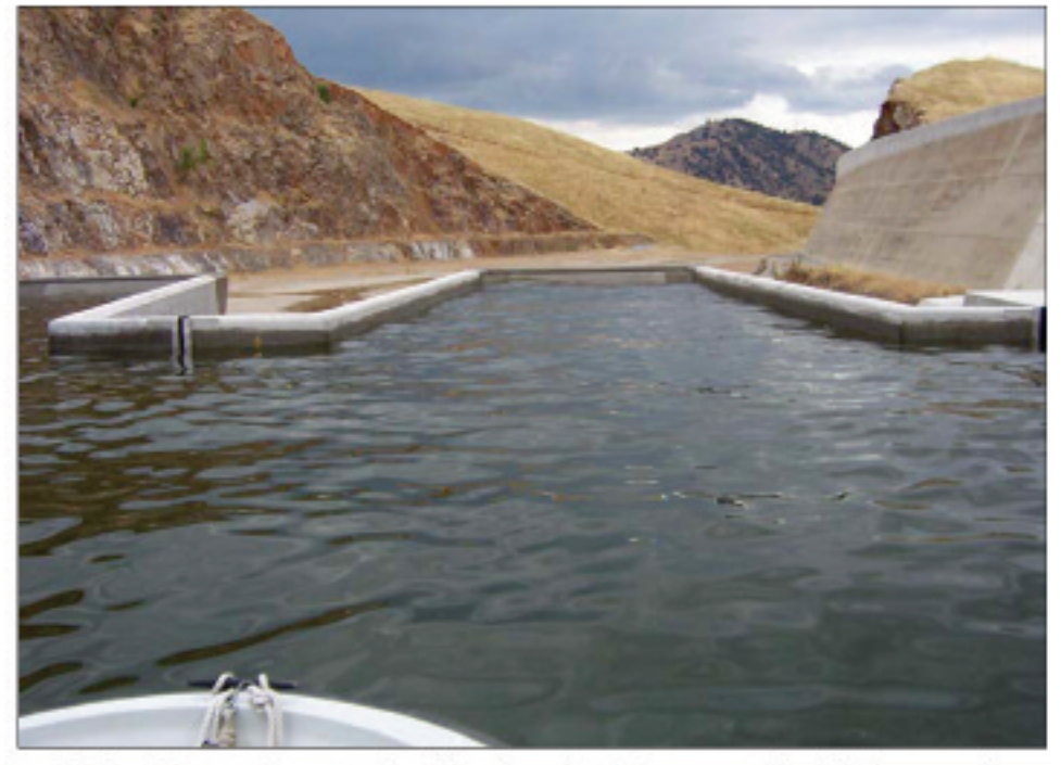
Earlier this year, the water level has been just inches away from flowing over the spillway at Lake Kaweah in Tulare County. Despite an abundant rain season, the Central Valley still struggles from previous years of drought conditions and greater water demand.

800,000 acre-feet of CVP water for the environment.