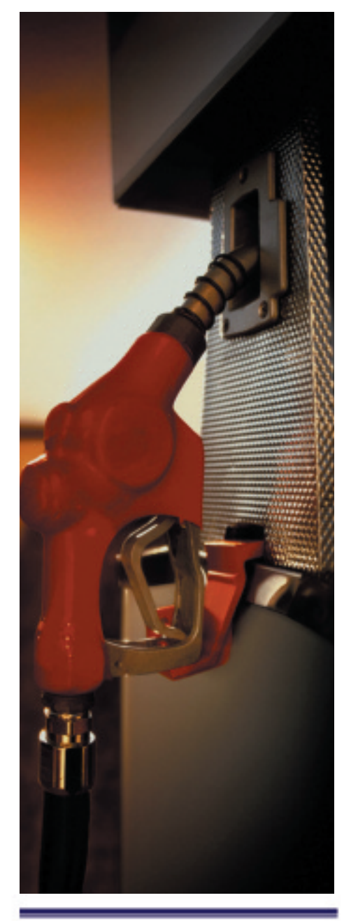
If you have a problem with a federal agency, please don't hesitate to stop by or call my offices in Visalia or Clovis.

Visalia — 559-733-3861 113 N. Church St., Suite 208 Visalia, CA 93291