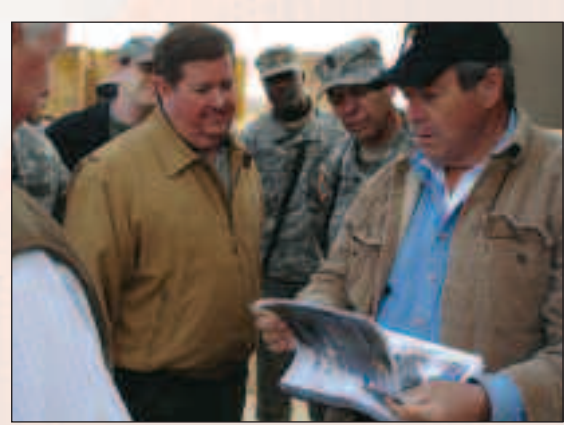
Ken Calvert and House Armed Services Committee Chairman Duncan Hunter review military plans in Iraq.

Solving inter-county traffic problems is a top priority for the region, I continue to support building grade separations in the City of Riverside and elsewhere, improving traffic flow on Interstate 15 and completing the Foothill South project to take cars off of Interstate 5 in south Orange County.